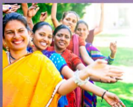
CULTURAL CROSSROADS Multicultural Entertainment Grandstand @ 8pm