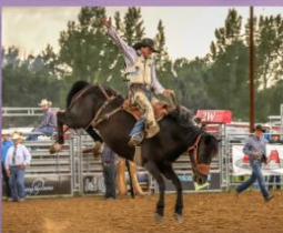
Plewis Automotive Group CCA RODEO Magnus Newland Arena @ 5pm