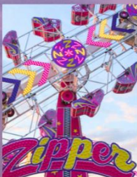
MIDWAY OPENS Kinetic Park @ 4pm