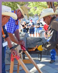
PANCAKE BREAKFAST Downtown @ 7:30am