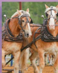
HEAVY HORSES Magnus Newland Arena Chore Team @ 10am, Pulls @ 5pm

WWW.SWIFTCURRENTEX.COM KINETIC PARK @SCAGEX (306) 773-2944