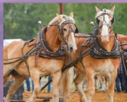
HEAVY HORSE PULLS Magnus Newland Arena @ 1pm

WWW.SWIFTCURRENTEX.COM KINETIC PARK @SCAGEX (306) 773-2944