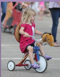
KIDDIES DAY PARADE Downtown @ 4pm